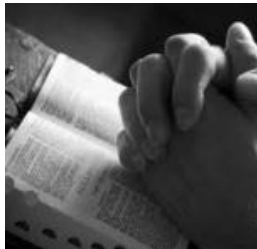
Prayer and Scripture