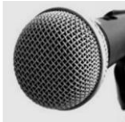
An inner voice