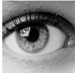
New vision or insight