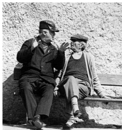
Words from another