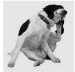
A niggling feeling